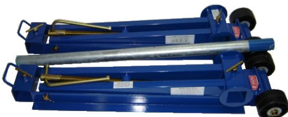
DRUM JACK NO.2 FOLDED DOWN FOR TRANSPORTATION.