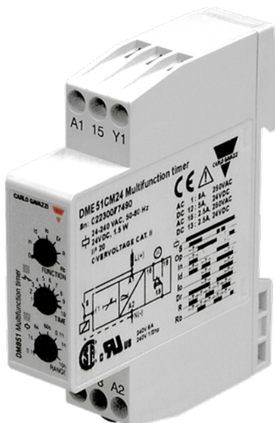
Representative Photo Only (actual product may vary based on configuration selections)

Time delay relay, multifunction, 12 - 240V AC/DC, 1 C/O, DIN rail