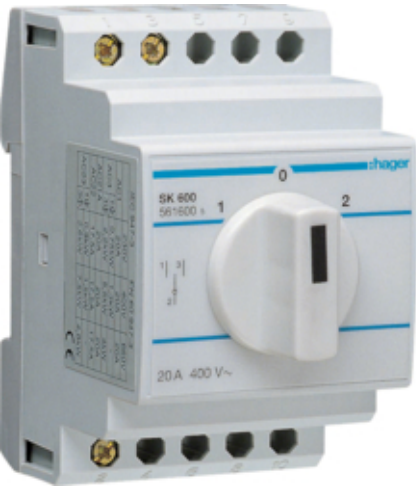
Selector switch non spring ret